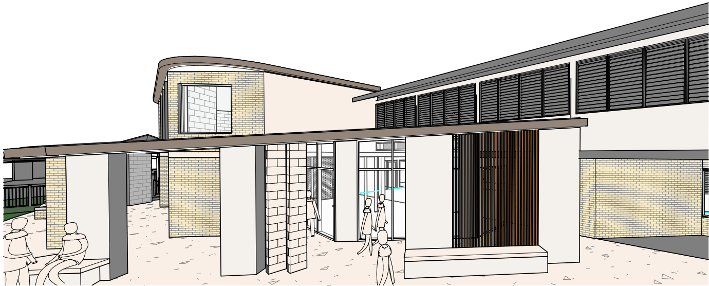
3 PERSPECTIVE 3