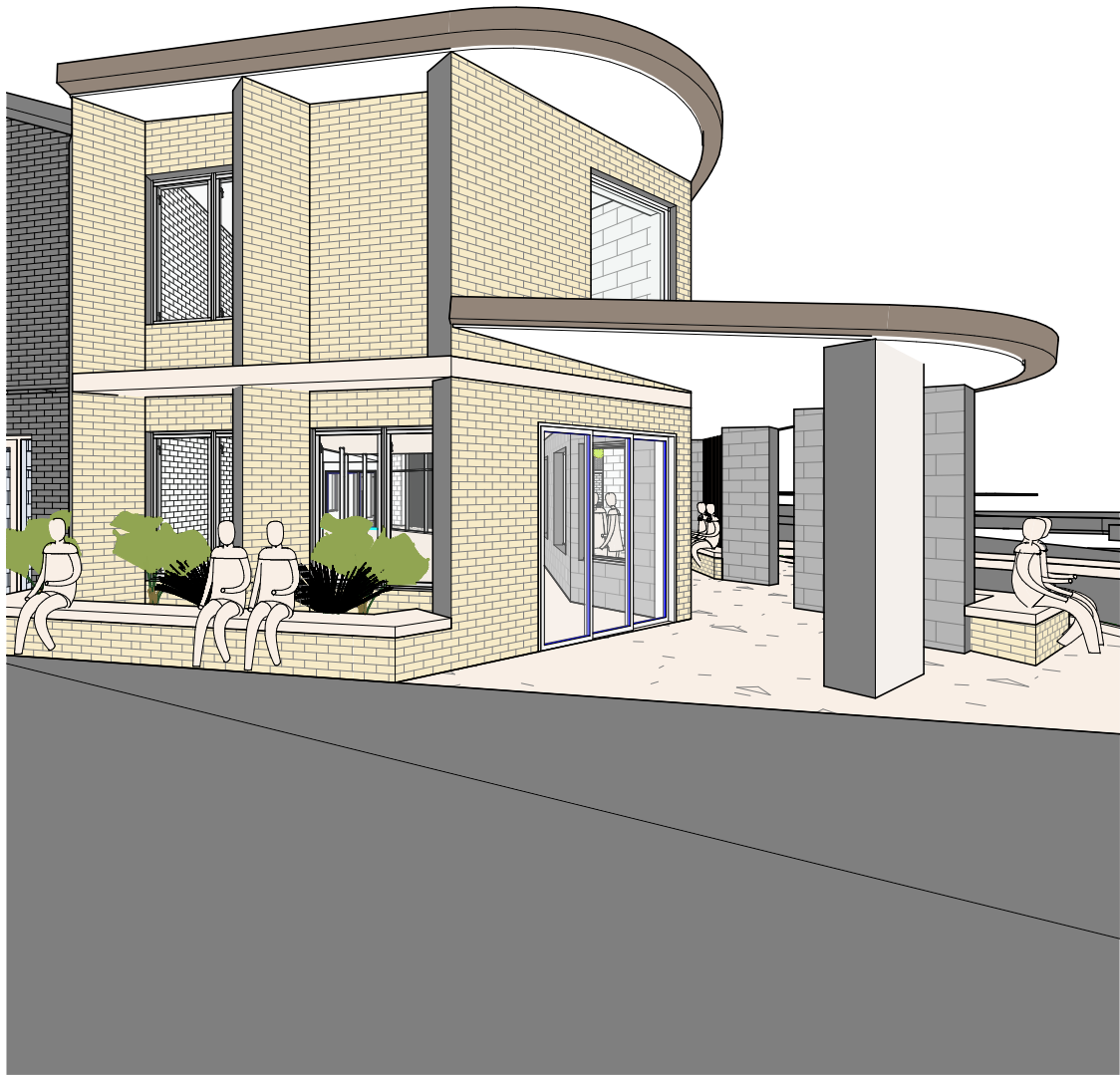
1 PERSPECTIVE 1