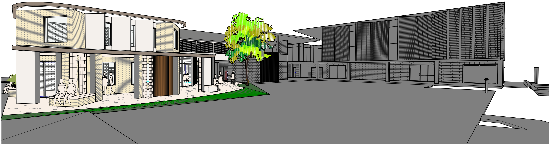
4 PERSPECTIVE 4